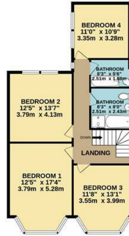
1ST FLOOR 867 sq.ft. (80.5 sq.m.) approx.